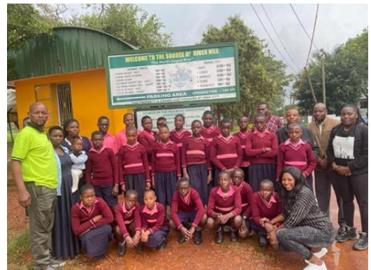
At the source of the River Nile

The Deputy Head Teacher sent a more detailed report including the following additional points: