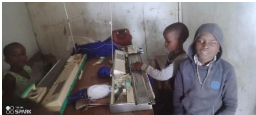
Children learning to use the knitting machines to make sweaters

Learning how to garden and grow vegetables is important and they can spend time on the school farm. They can also spend time on craft activities, making mats, bags, necklaces etc. These three photos show that, from an early age, the children are taught other practical skills such as how to use the knitting machines. They are also taught how to make potato crisps and liquid soap!