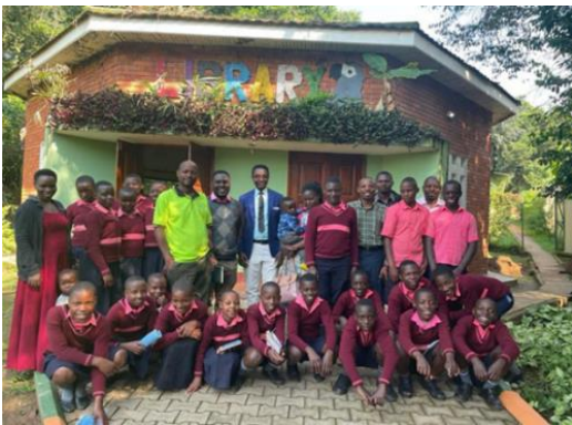
Pupils and teachers at the Wildlife Museum Library

My testimony is that everything was interesting and educational. Pupils learned a lot from the facilitators and have promised to apply all the knowledge and experience in their learning. Very soon, each one of them will draft a handwritten report/essay summarizing the course of their trip, and I will send you scanned copies from pupils and teachers who participated.”