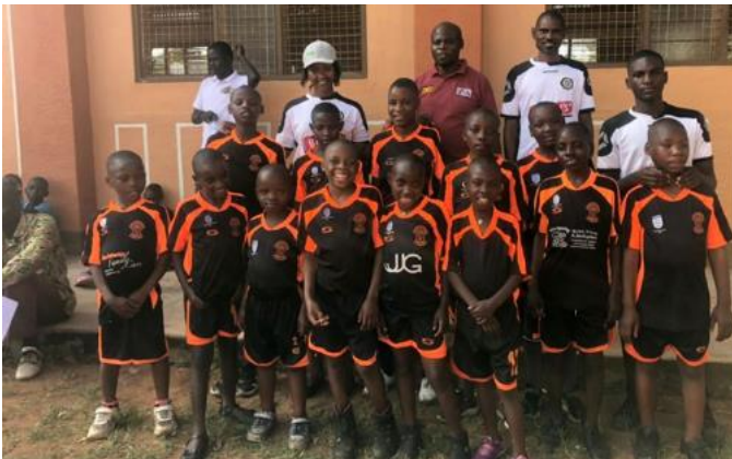
Teachers with the team at Kitgum

Despite these issues the participation of the children was an amazing experience for them, as was the travel itself as they got to see parts of the country where there were many chimpanzees, the Ichuya forest reserve and the Murchison waterfalls. We also heard that 'children were excited to see old women cycling in Kitgum as in Kisoro they neither ride cycles nor motorcycles!'