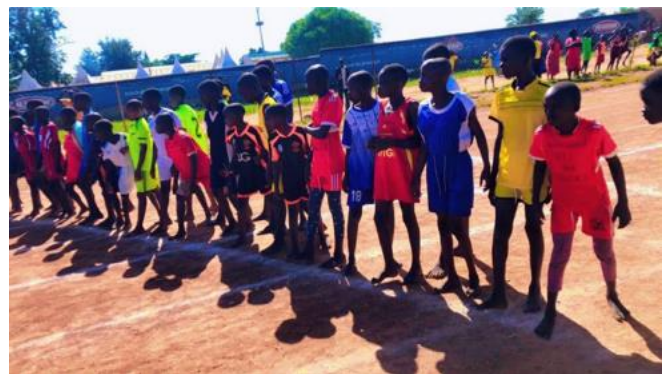
5000 meters race!