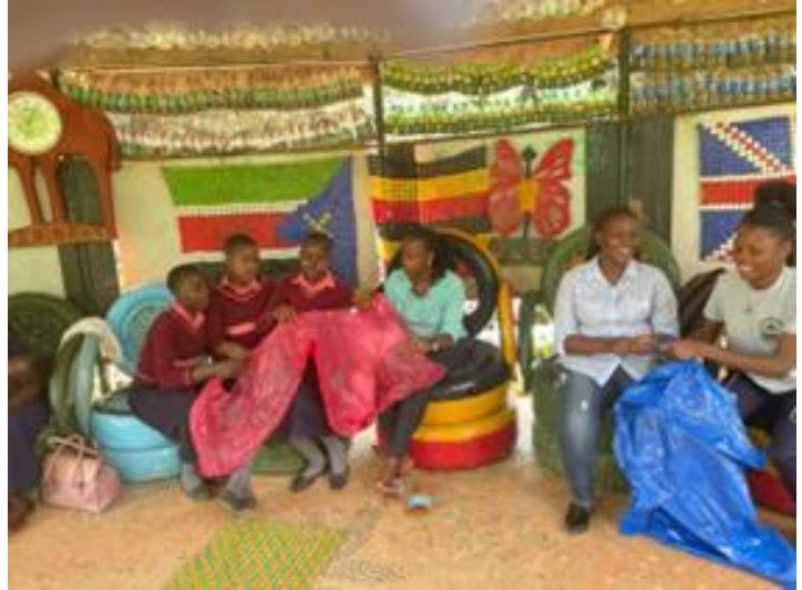
Learning how to recycle tyres and plastics

Throughout the whole journey no one got an injury or fell sick, Glory to God!"