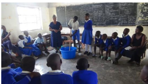
Children learning to make liquid soap