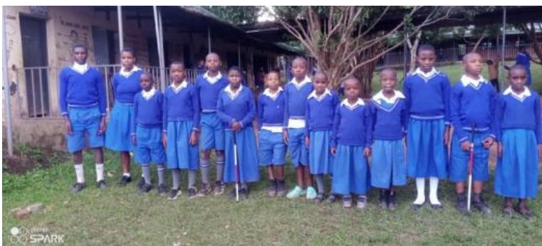
KDS team that went to the Sports competition (Athletics)